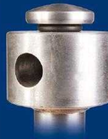
Integral Tee Handle