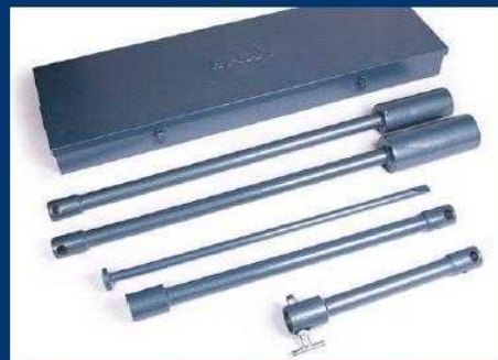
Kit to include: 2 x UniKeys, 2 x Shaft Extensions & Pin, 'Tee' Handle, Steel Storage Case

The company follows a policy of continuous product development and as such reserves the right to make alterations to equipment, techniques and procedures without prior notice.