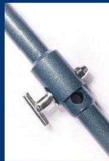
Shaft Extension secured with pin

The emphasis is on 'quality'... all components are made, assembled and tested in the UK in compliance with Hy-Ram's ISO9001 certification.